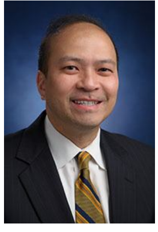
4th Congressional District Baoky N. Vu