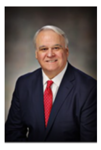
8th Congressional District Calder B. Clay, III