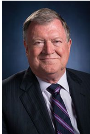
14th Congressional District Joe W. Yarbrough