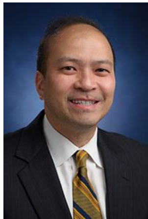
4th Congressional District Baoky N. Vu